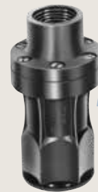
1966 Senninger Pressure Regulator