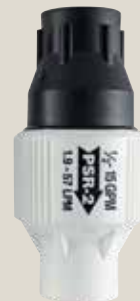
PSR-2 Today's Senninger Regulator