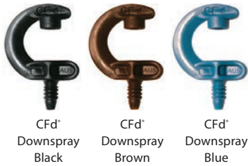
CFd® Downspray Black CFd® Downspray Brown CFd® Downspray Blue

Nurseries, tree lots, potted plants, home and landscaped gardens.