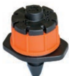
Shrubbler® 360° PC Barb 0.16"