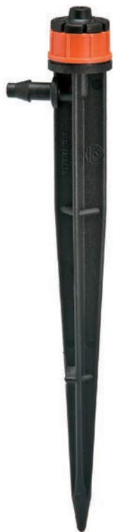
Shrubbler® 360° PC Spike 0.16"