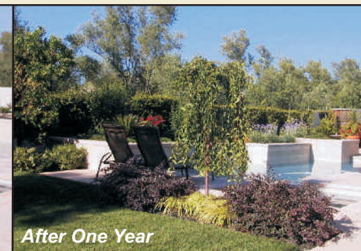
After One Year